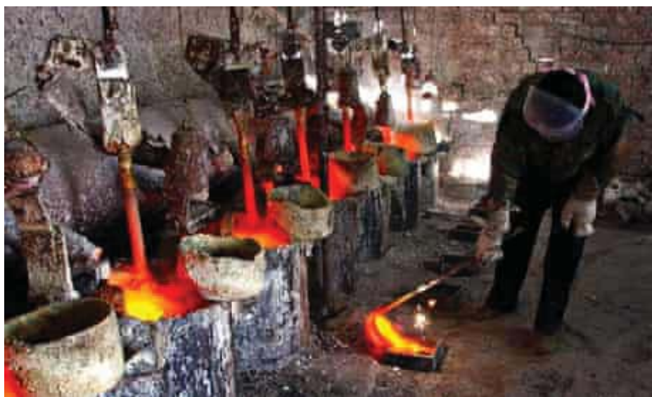
A worker pours rare earth metal lanthanum into a mould near the town of Damao, in China's Inner Mongolia Autonomous Region.

Even as America tightens emission standards, the fast-growing economies of Asia are filling the air