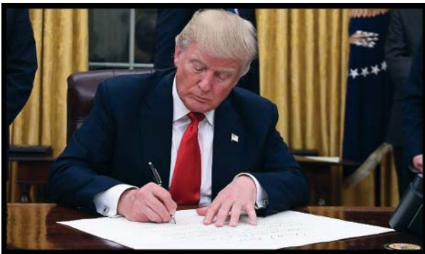
Recognizing America's vulnerability to China's monopoly on critical minerals, President Trump signed Executive Order #13817 on December 20, 2017.

years, fifteen years, or even longer for a mining company to get from explo-