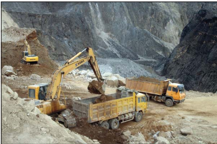
Excavators dig rare earths at Jiangxi Copper Corp’s Sichuan branch in Chengdu, Sichuan Province of China.

In 1995, China’s National Non-Ferrous Import Corporation was allowed to purchase Magnequench, a high-tech magnet manufacturer in Indiana. Three years later, the facility closed its doors. By 2003, the company was renamed and all equipment had been moved to facilities in Tianjin, China.