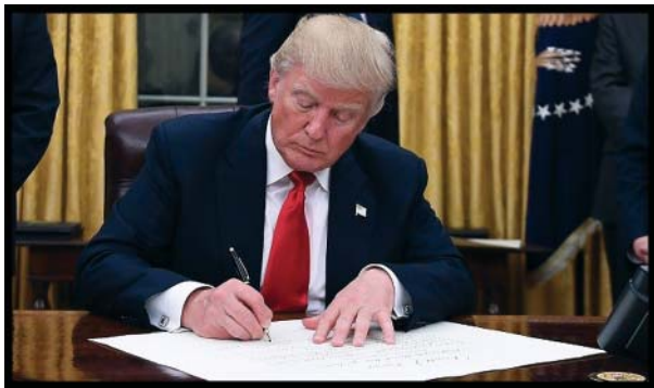
Recognizing America's vulnerability to China's monopoly on critical minerals, President Trump signed Executive Order #13817 on December 20, 2017.

Current permitting schemes can take ten years, fifteen years, or even longer for a mining company to get from explo-